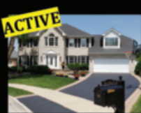
1634 Ithaca Dr