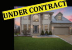
3812 Celeste Ln

Penny O'Brien | 630.207.7001 | penny.obrien@bairdwarner.com