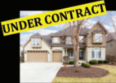
5208 Bamboo Ln