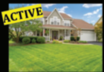
5323 Bundle Flower Ct