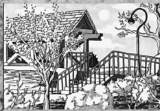
"A Bridge to Friendship"

Join us for coffee and discover what NNNC has to offer, including activities, events, learning experiences, charitable opportunities, community involvement, fun and friendship!