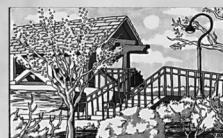
"A Bridge to Friendship"

Join us for coffee and discover what NNCC has to offer, including activities, events, learning experiences, charitable opportunities, community involvement, fun and friendship!